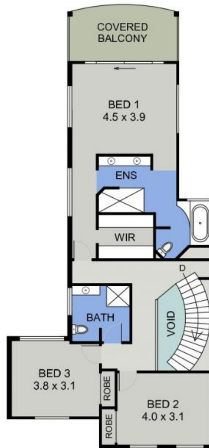
UPPER FLOOR PLAN ( 102 sq m Approx )