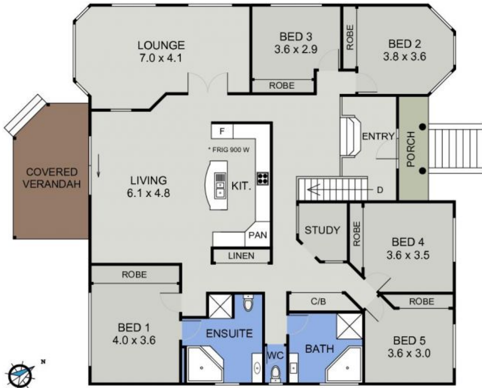
UPPER FLOOR PLAN ( 221 sq m Approx )