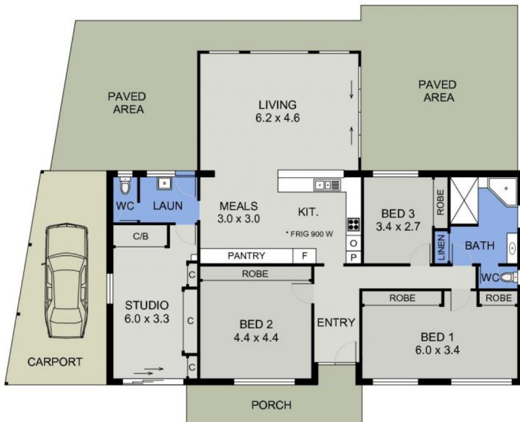
FLOOR PLAN ( 167 sq m Approx )