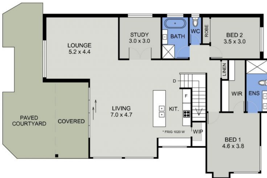
MAIN FLOOR PLAN (152 sq m Approx)