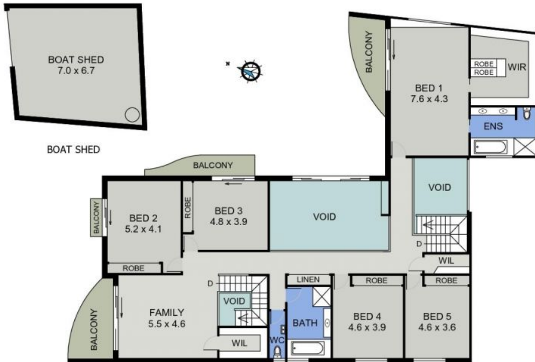
UPPER FLOOR PLAN ( 233 sq m Approx )