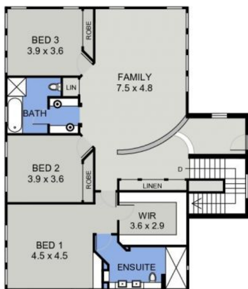
UPPER FLOOR PLAN (165 sq m Approx )