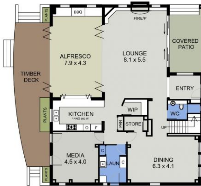
LOWER FLOOR PLAN (197 sq m Approx )