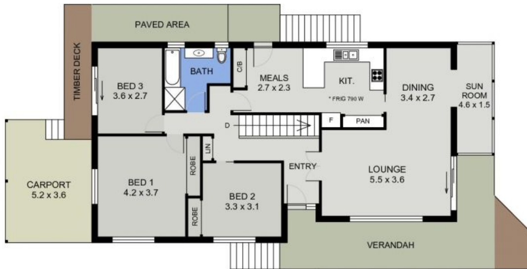
UPPER FLOOR PLAN ( 132 sq m Approx )