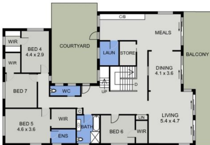
LOWER FLOOR PLAN approx 192m 2