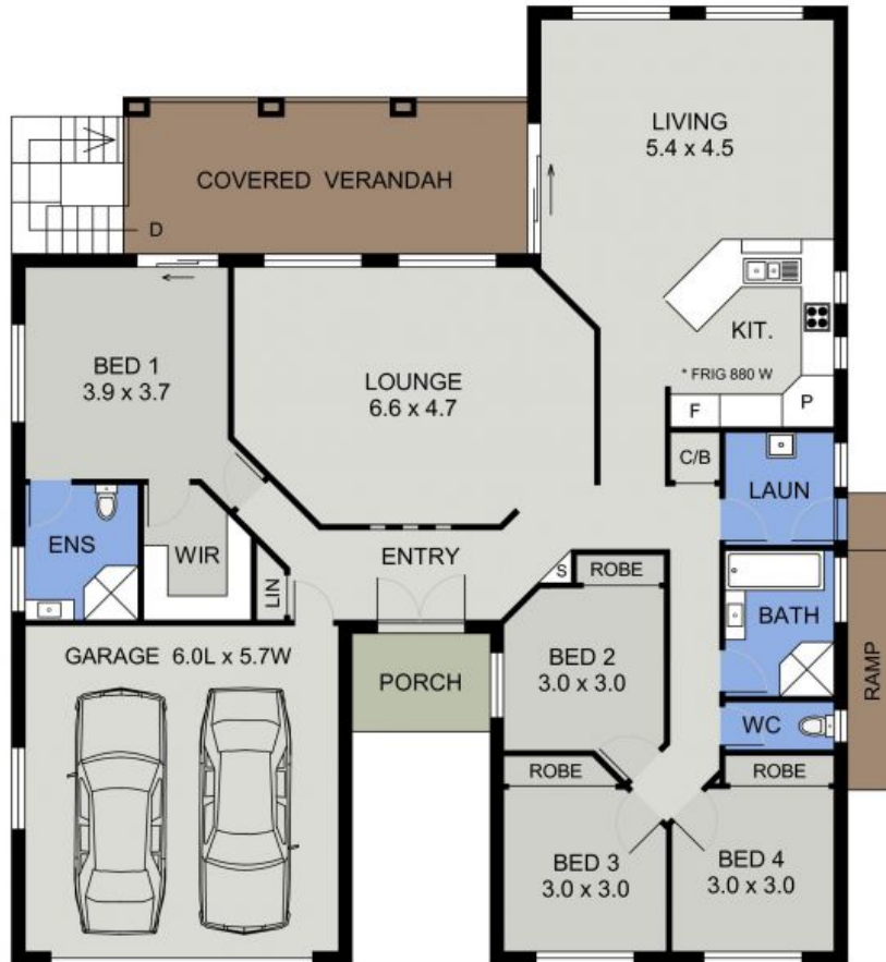
MAIN FLOOR PLAN ( 211 sq m Approx )