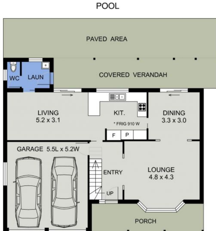
LOWER FLOOR PLAN ( 113 sq m Approx )