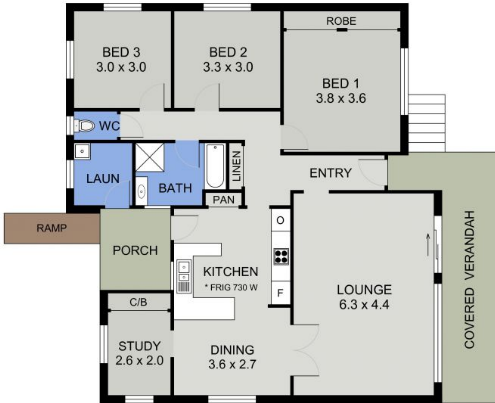
HOUSE PLAN (128 sq m Approx )