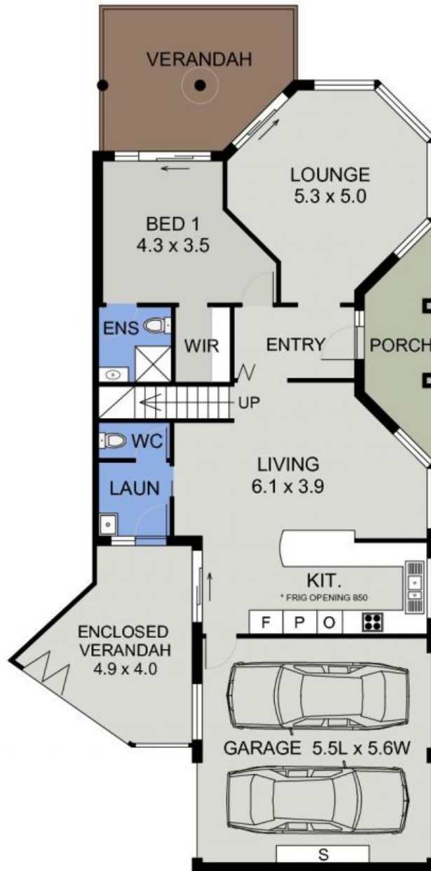
LOWER FLOOR PLAN ( 146 sq m Approx )