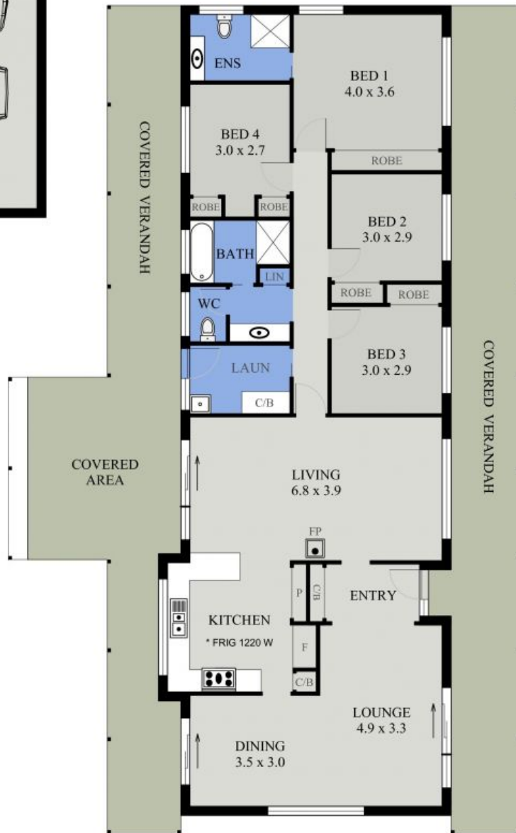
HOUSE FLOOR PLAN (161 sq m Approx )