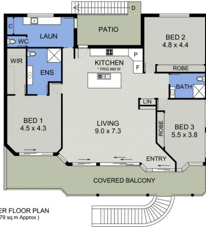
UPPER FLOOR PLAN (179 sq m Approx)