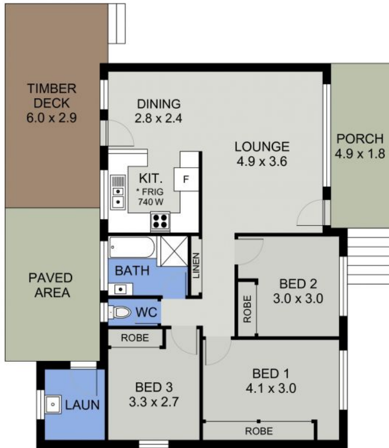
FLOOR PLAN (89 sq m Approx )