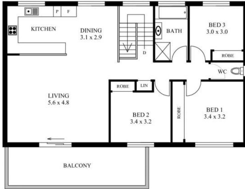
UPPER FLOOR PLAN ( 108 sq m Approx )