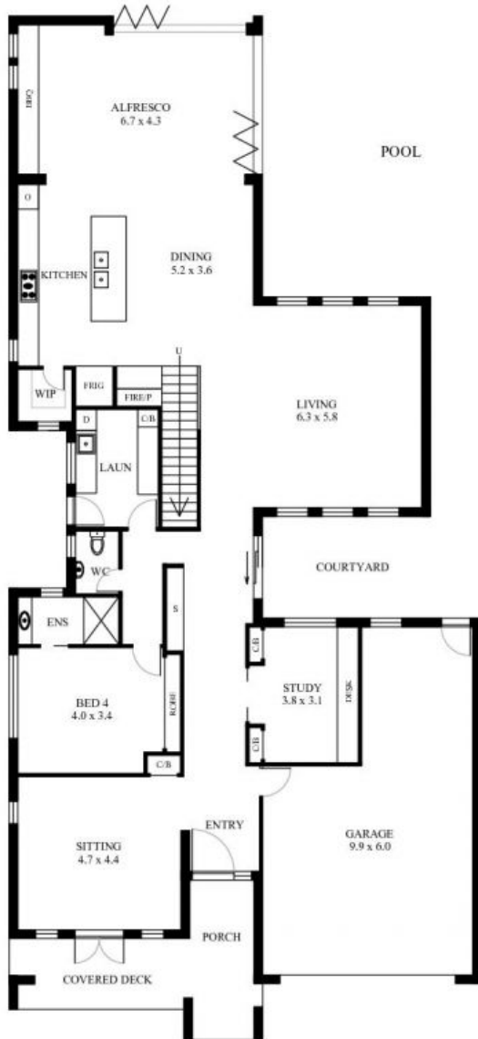
LOWER FLOOR PLAN (276 sq m Approx.)