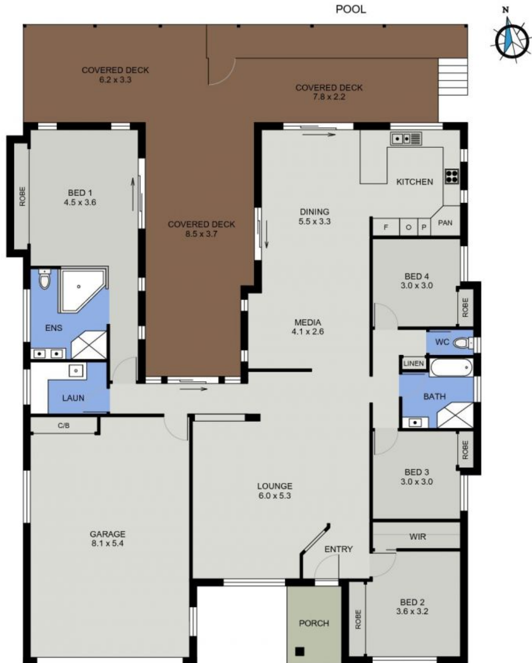
FLOOR PLAN ( 238 sq m Approx )