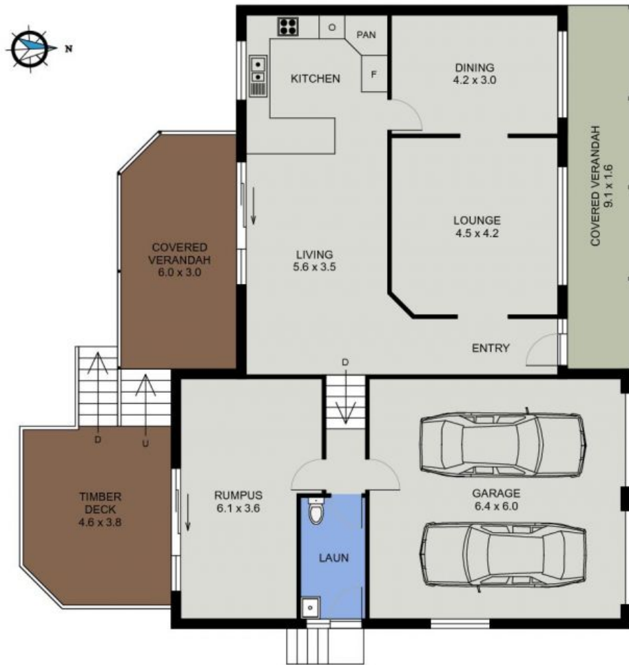
LOWER FLOOR PLAN ( 153 sq m Approx )