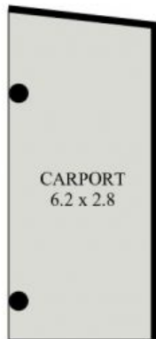
FLOOR PLAN (173 sq m Approx)