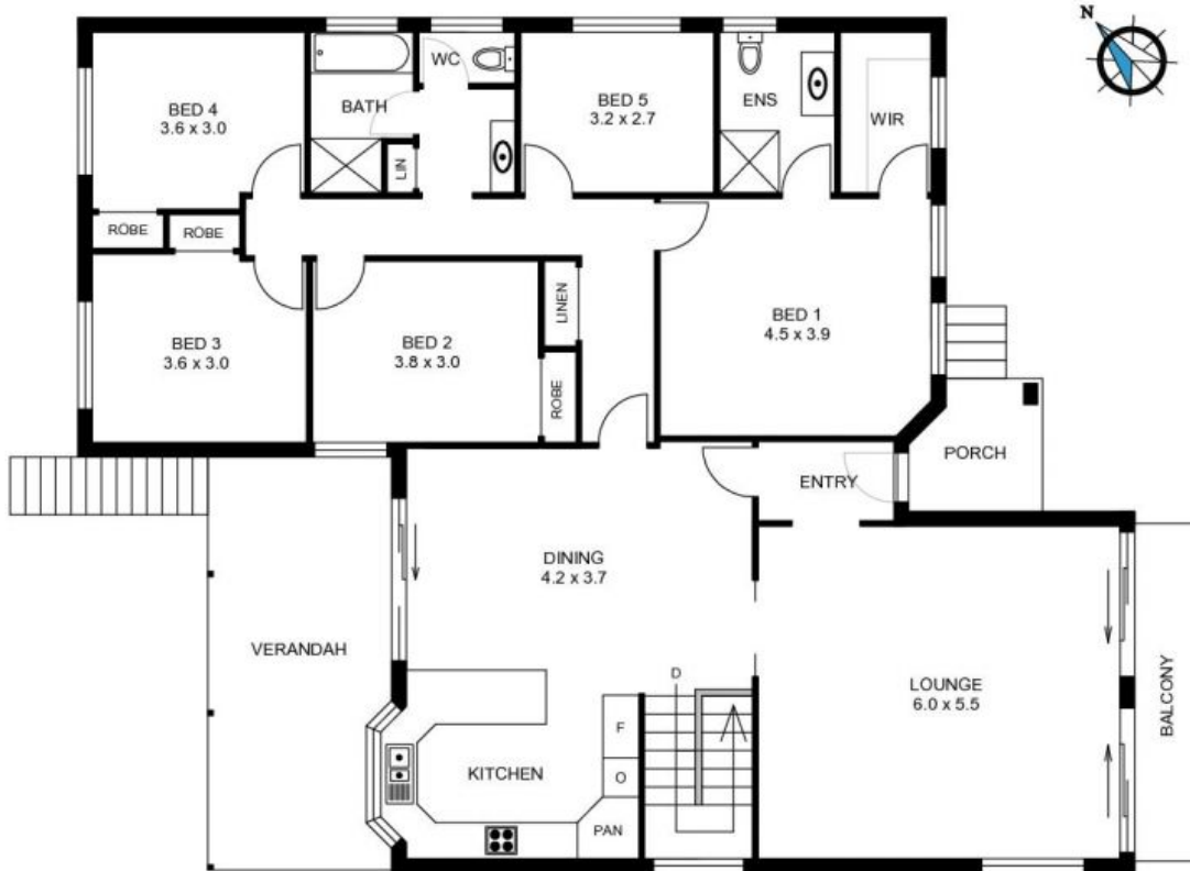
UPPER FLOOR PLAN ( 187 sq m Approx )