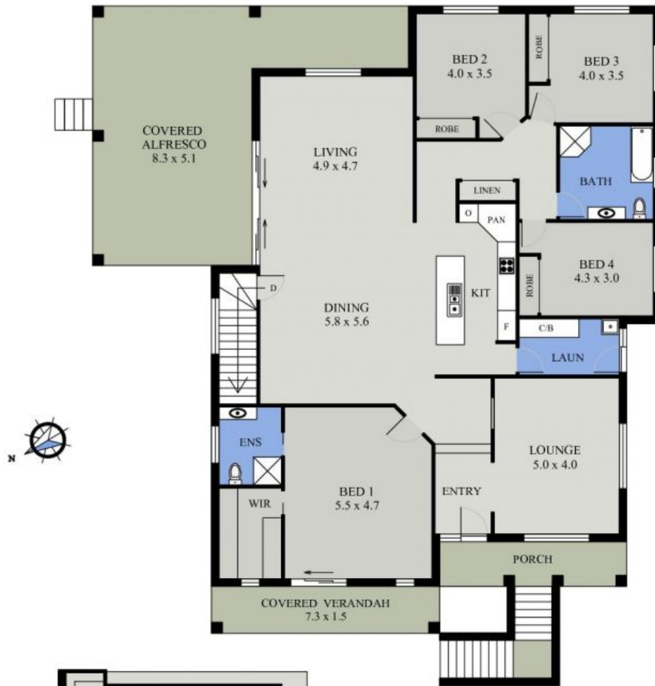
MAIN FLOOR PLAN (229 sq m Approx)