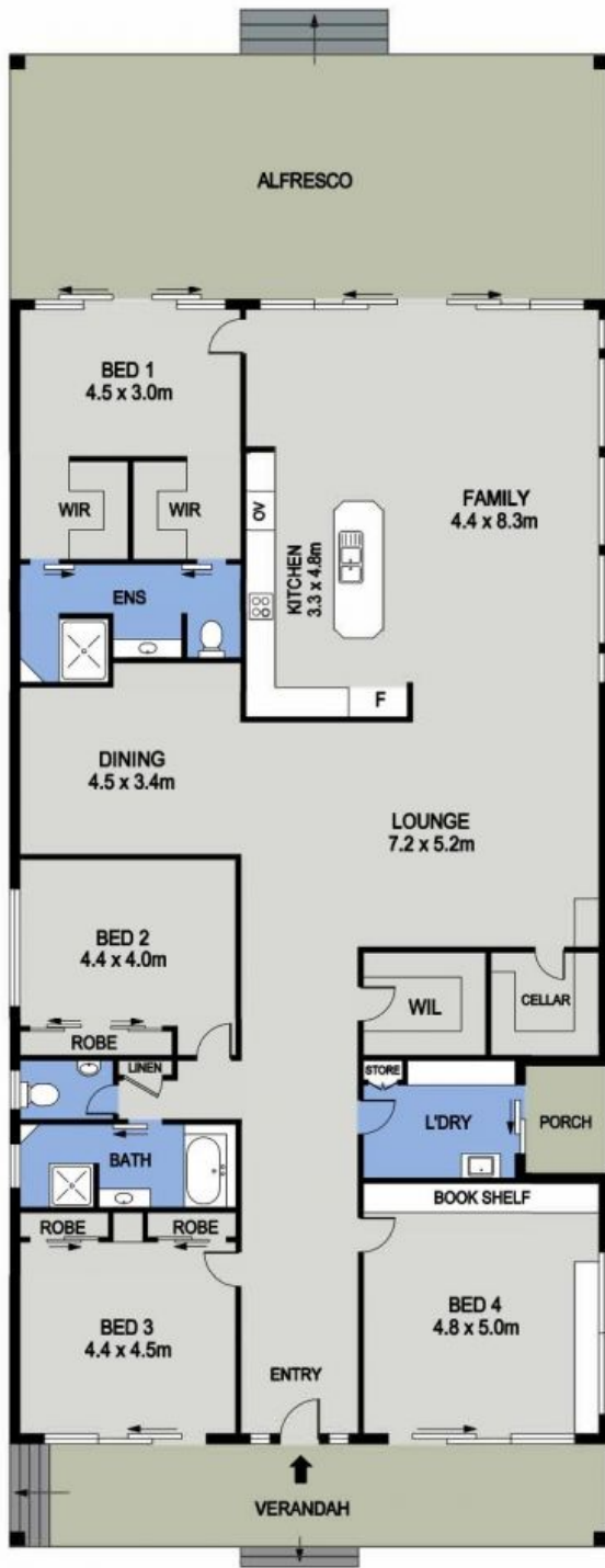
FLOOR PLAN ( 382 sq m Approx)