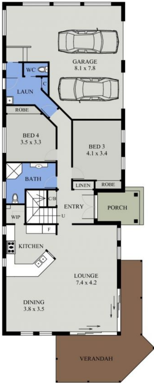
LOWER FLOOR PLAN (190 sq m Approx)