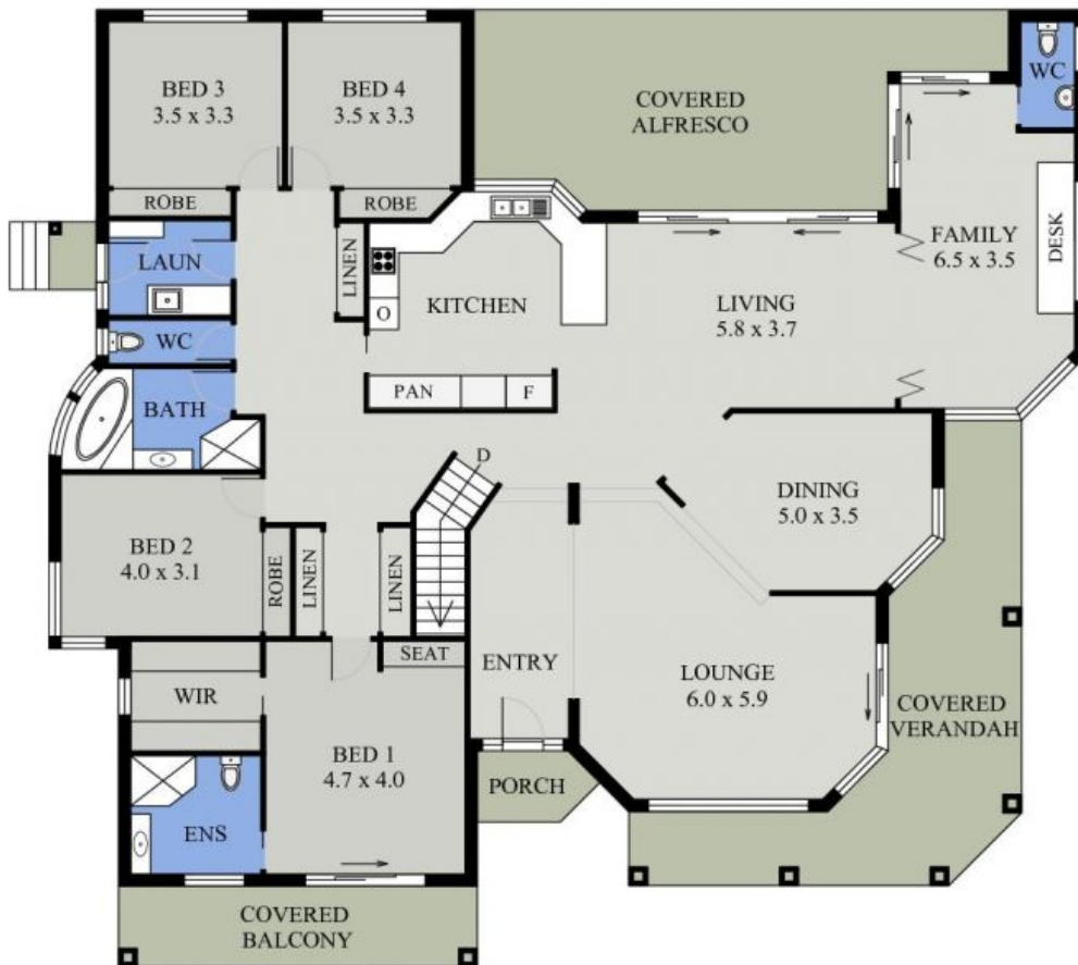
MAIN FLOOR PLAN (264 sq m Approx)