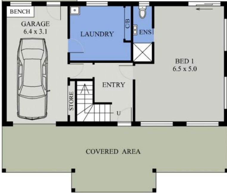
LOWER FLOOR PLAN (87 sq m Approx)