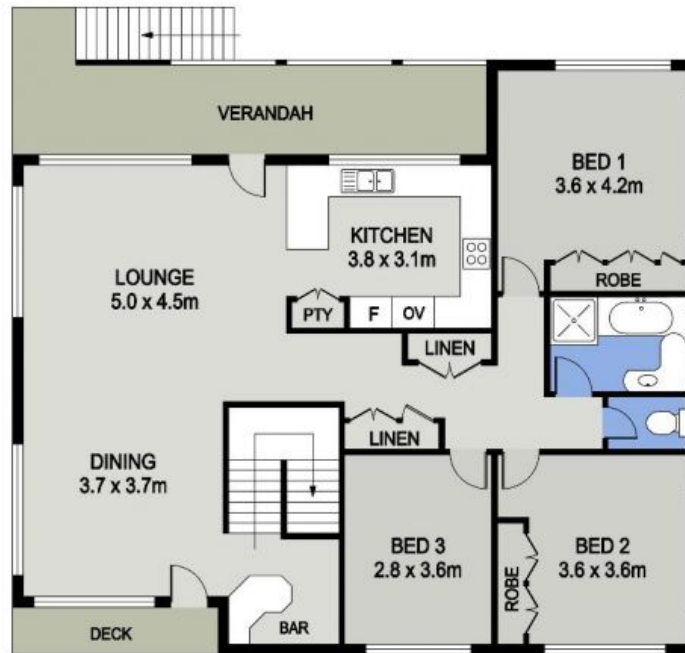
UPPER PLAN (118 sq m Approx)