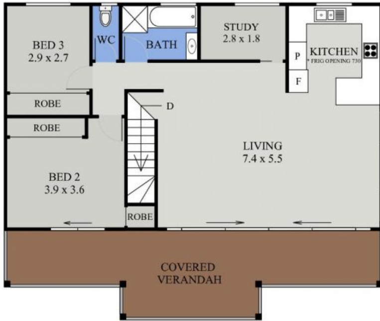
UPPER FLOOR PLAN (95 sq m Approx)