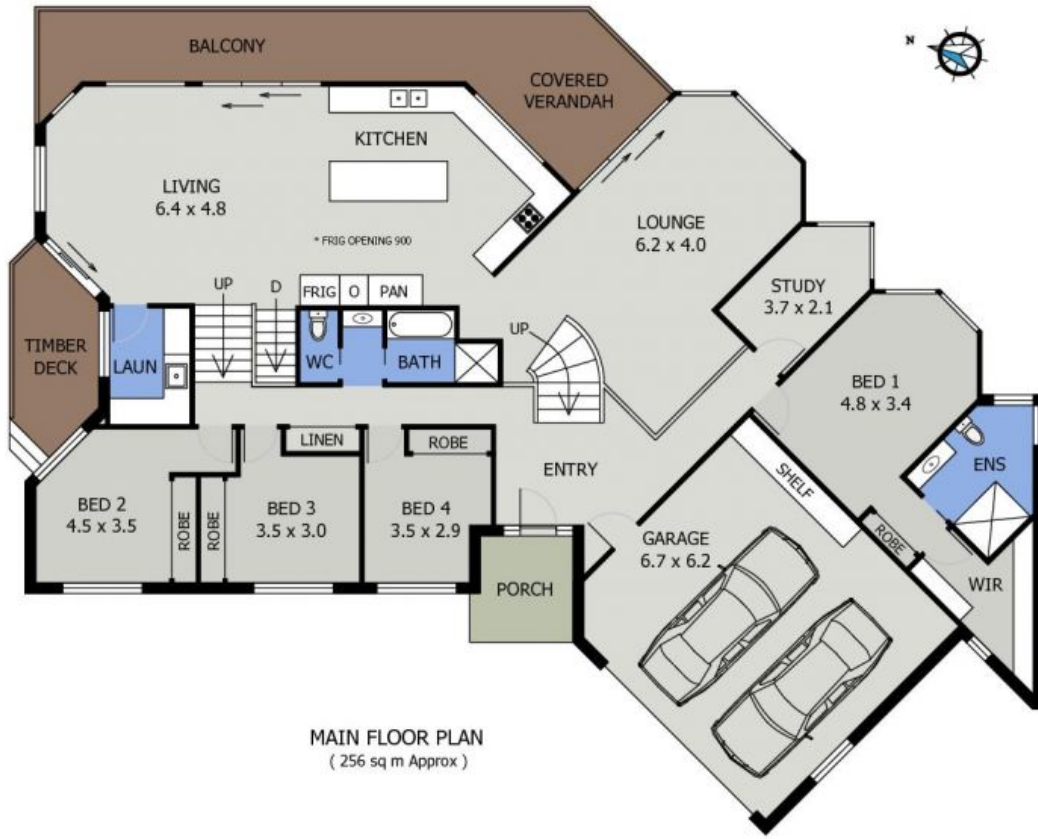
MAIN FLOOR PLAN ( 256 sq m Approx )