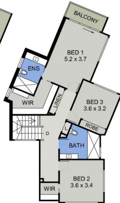
LOWER FLOOR PLAN ( 90 sq m )