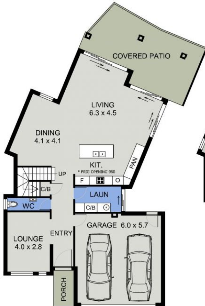
MAIN FLOOR PLAN ( 138 sq m )