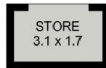
STORAGE UNDER LIVING