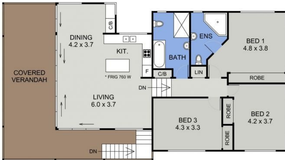
UPPER FLOOR PLAN (124 sq m Approx)