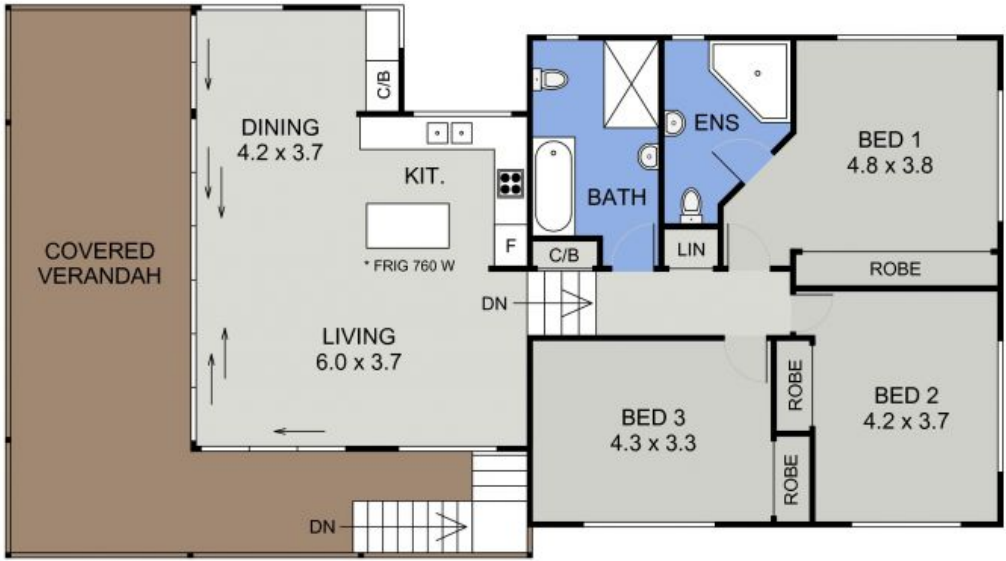
UPPER FLOOR PLAN (124 sq m Approx)