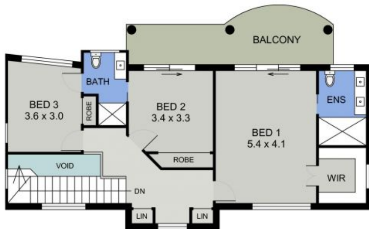
UPPER FLOOR PLAN (93 sq m Approx)