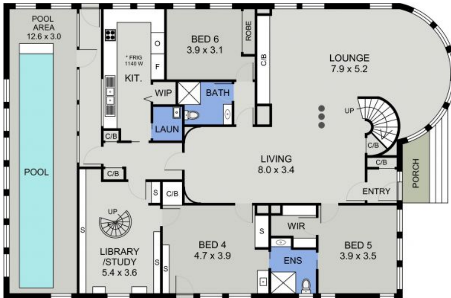
LOWER FLOOR PLAN (240m 2 Approx)