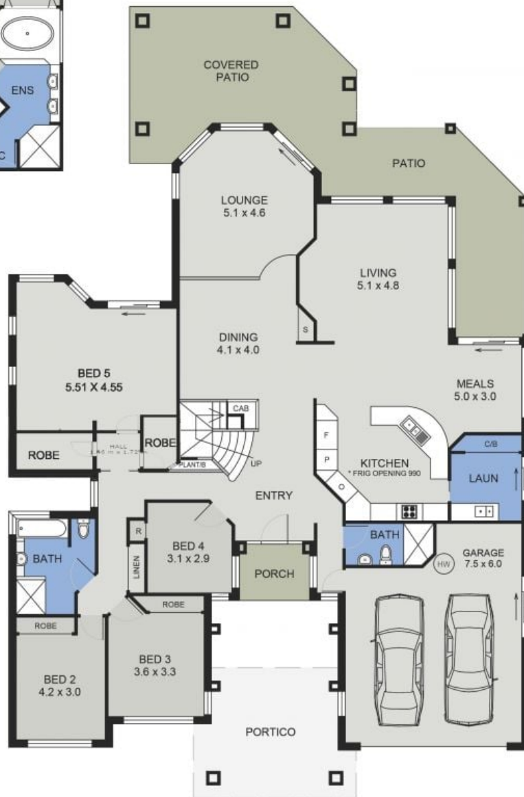
MAIN FLOOR PLAN (308 sq m Approx)