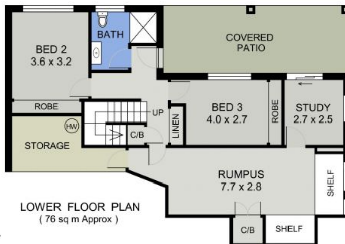
LOWER FLOOR PLAN ( 76 sq m Approx )