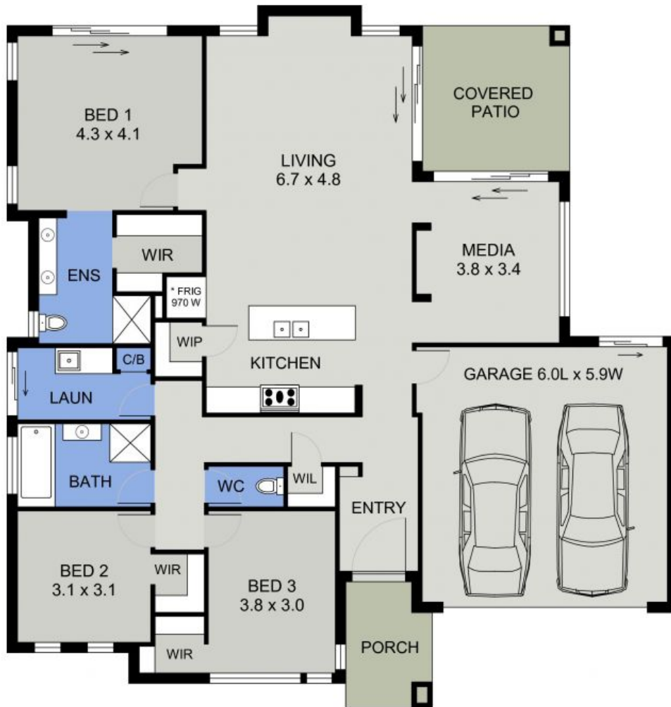
FLOOR PLAN (196 sq m Approx)