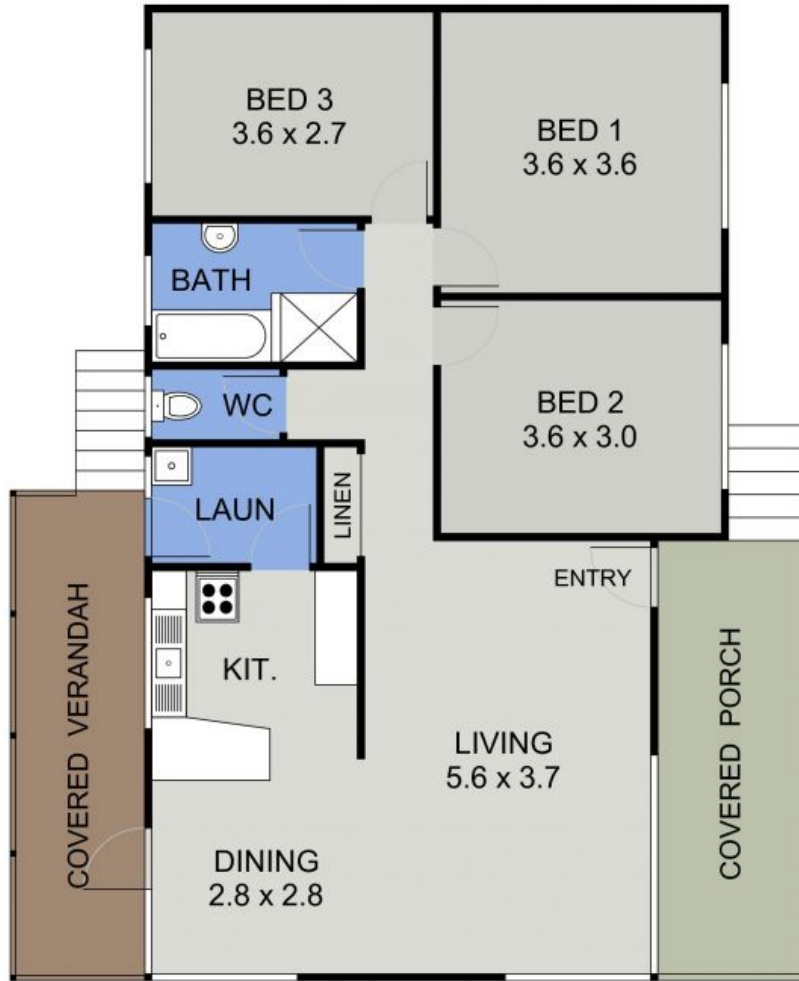
FLOOR PLAN (92 sq m Approx)