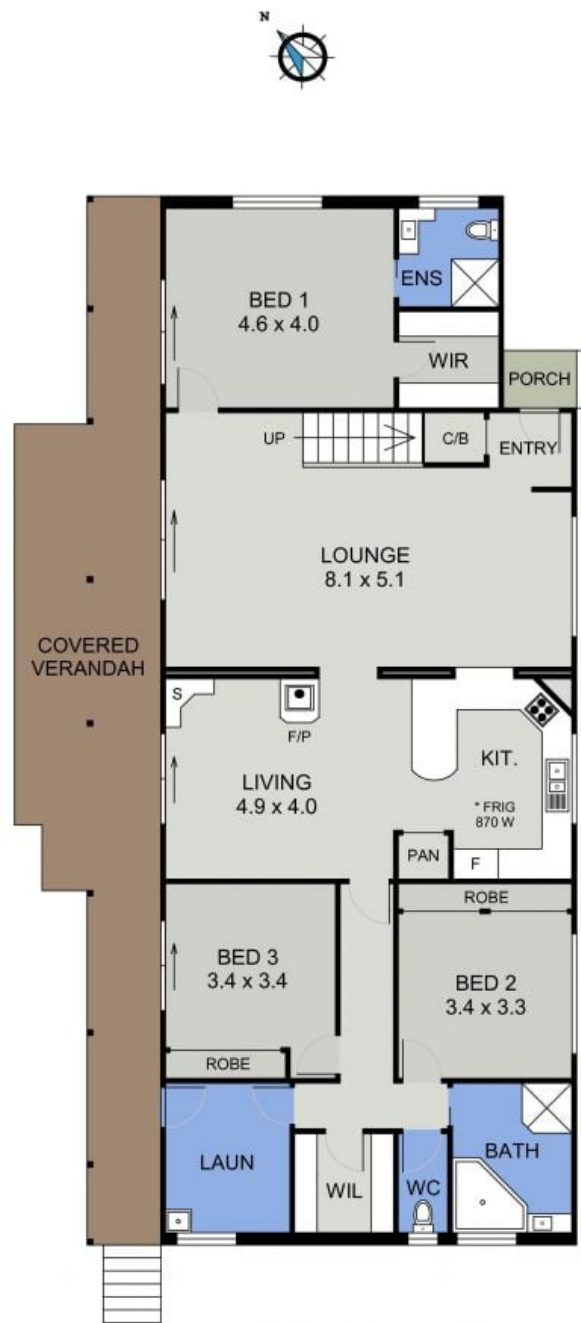
MAIN FLOOR PLAN (168 sq m Approx)