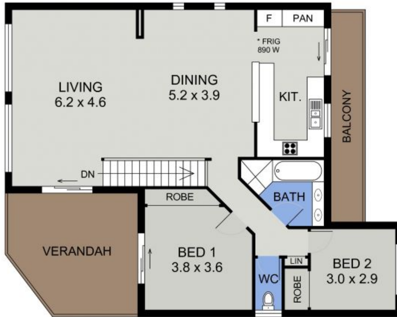
UPPER FLOOR PLAN (116 sq m Approx)