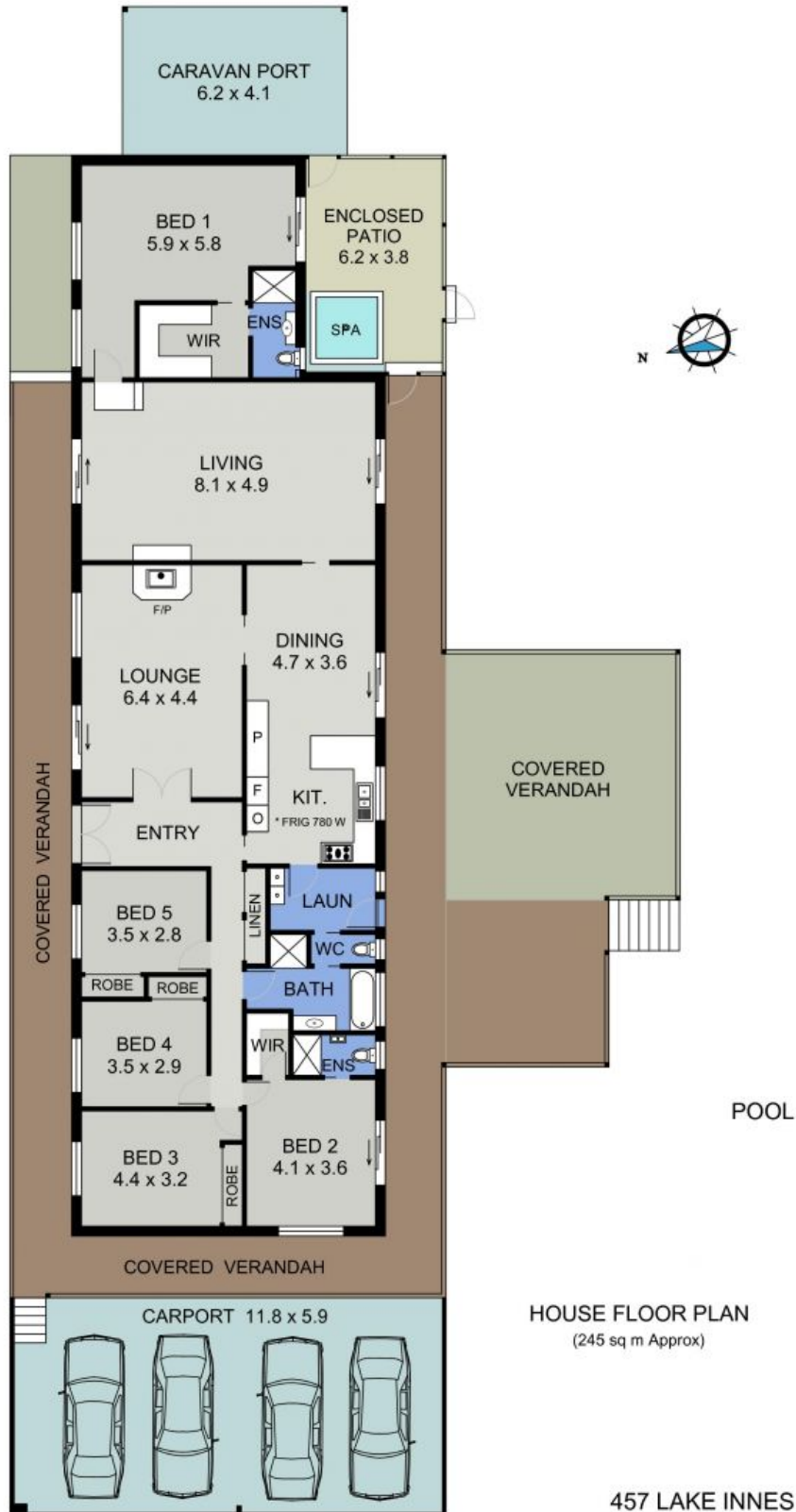
HOUSE FLOOR PLAN (245 sq m Approx)