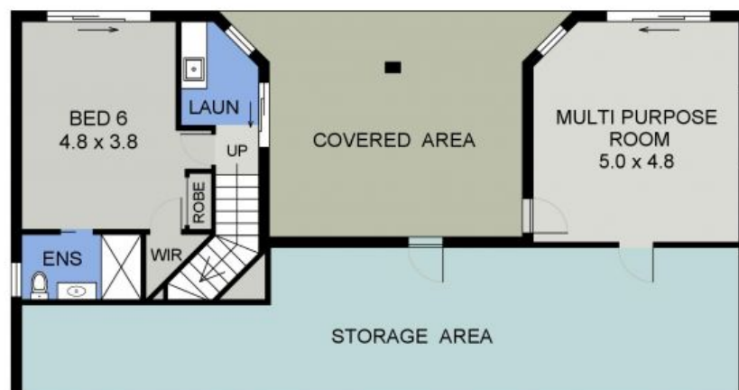
LOWER FLOOR PLAN (67 sq m Approx)