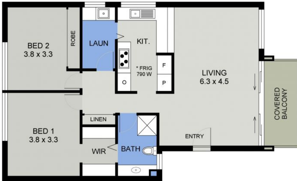
FLOOR PLAN ( 89 sq m Approx )