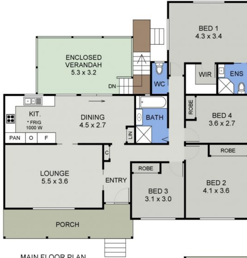
MAIN FLOOR PLAN ( 123 sq m Approx )