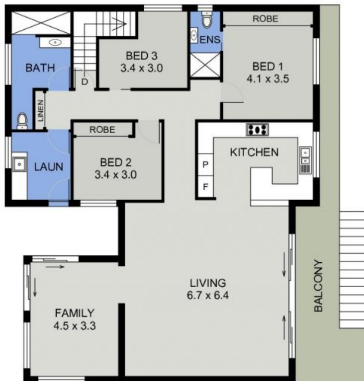
UPPER FLOOR PLAN ( 158 sq m Approx )