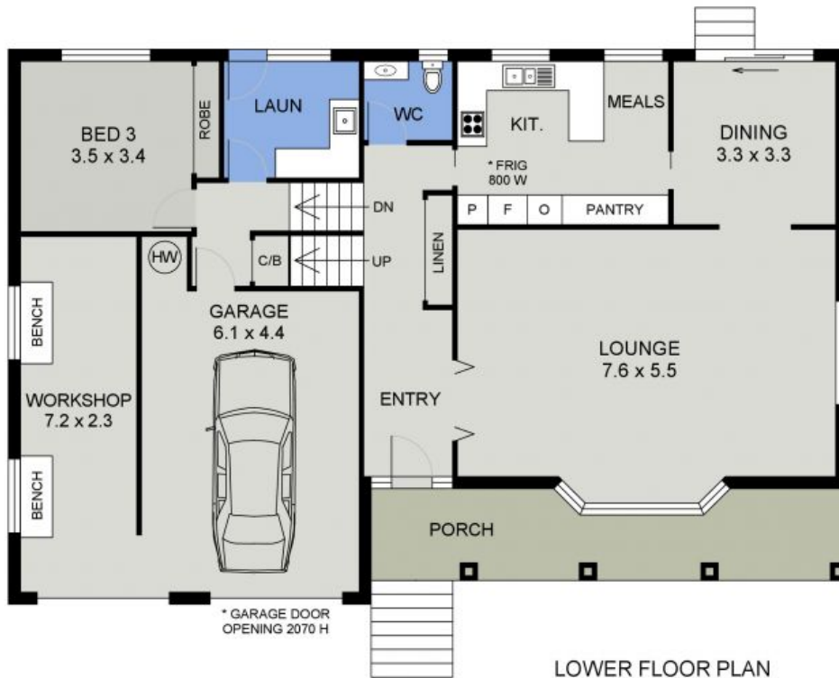
LOWER FLOOR PLAN ( 170 sq m Approx )