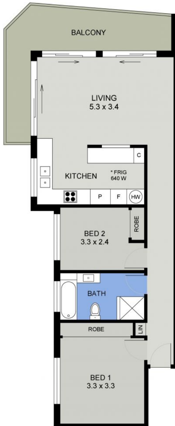
FLOOR PLAN ( 71 sq m Approx )