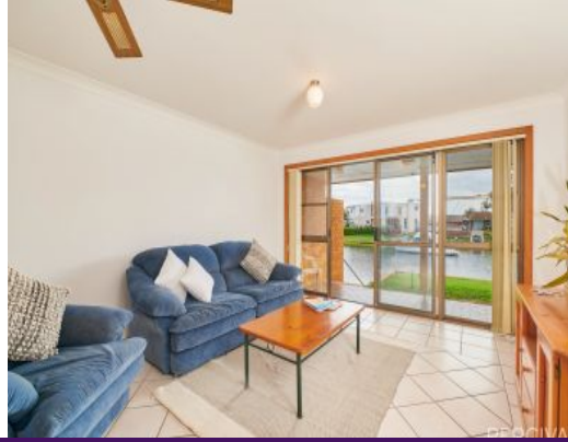
3/24 Scarborough Close Port Macquarie, NSW