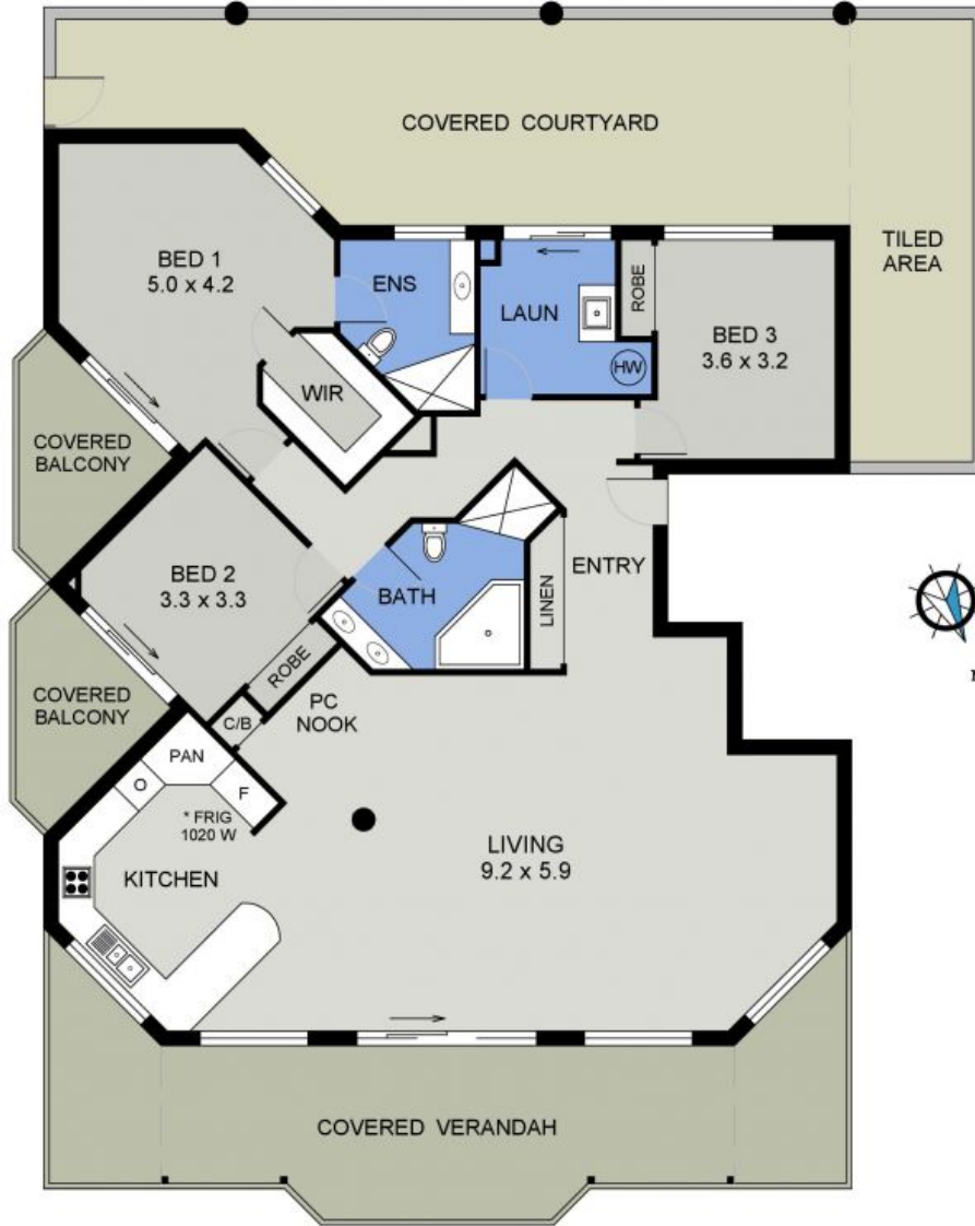
FLOOR PLAN ( 166 sq m Approx )