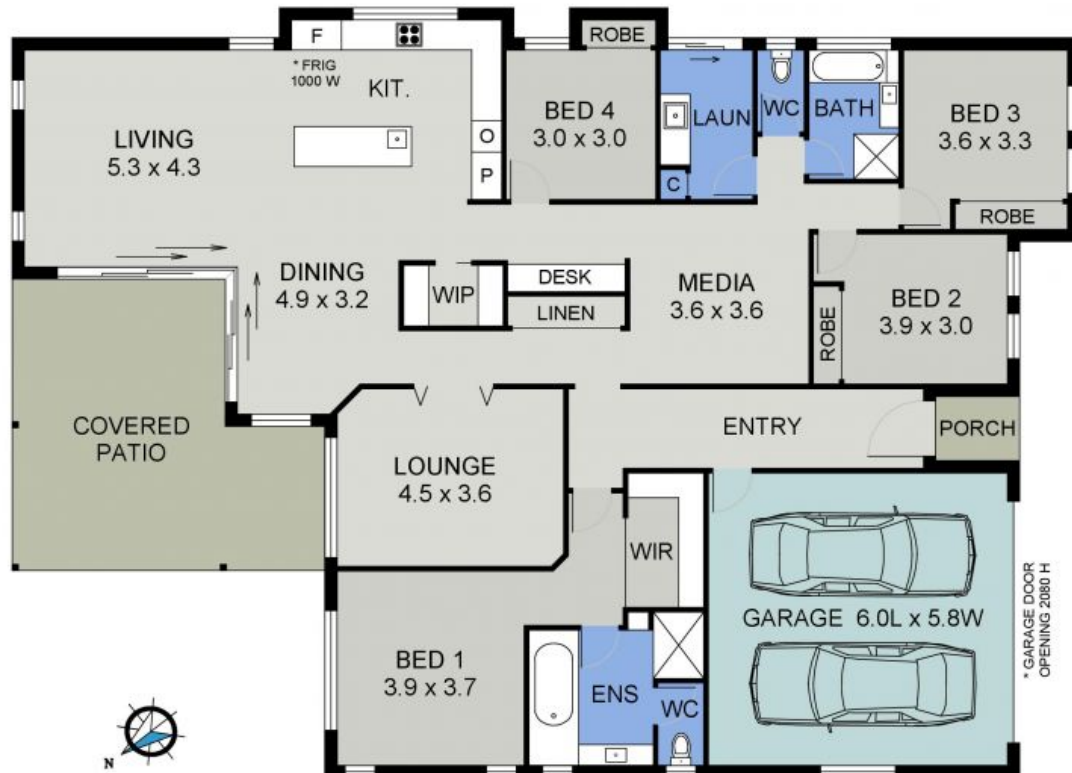
FLOOR PLAN ( 248 sq m Approx )